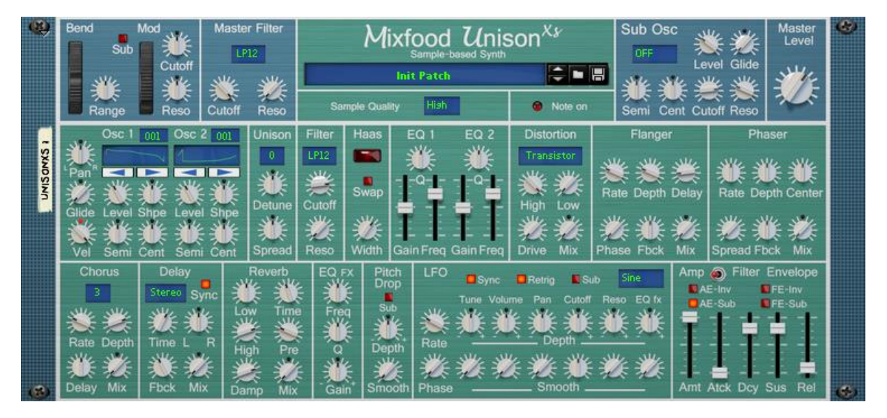
Mixfood Unison Xs is a sample-based synthesizer, the perfect tool for creating deep bass sounds and sharp synth sounds!

Equipped with 2 oscillators with a combined number of 1100! different waveforms, dedicated envelopes, LFO, pitch drop, effects, and a Unison effect with Stereo-spread. On the master output an extra filter is added. On top of it all a Sub oscillator is available to add extra depth to your sounds. For endless creative possibilities 6 audio outputs are available (main mix, 'dry' and 'wet' signal of each oscillator and sub-osc).